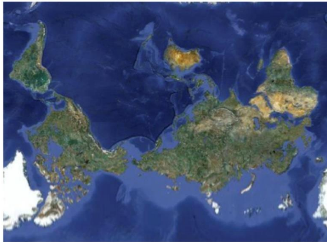
Figure 3 Time to reimagine Canada's place in the world?