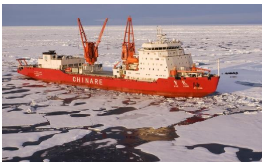
Figure 4 China's icebreaker, the Snow Dragon.

For example, ten years ago, most economists would say the Chinese economy was growing and was actively seeking resources, even in high-risk investment areas (geoeconomics). Most strategists would say there was an - admittedly tense - alignment of Russia and China, and that China was fast becoming a maritime power (geopolitics). And most climate experts would say that the Arctic was becoming more navigable, and that the Russian Arctic was opening up faster than the Canadian Arctic (geophysical changes).