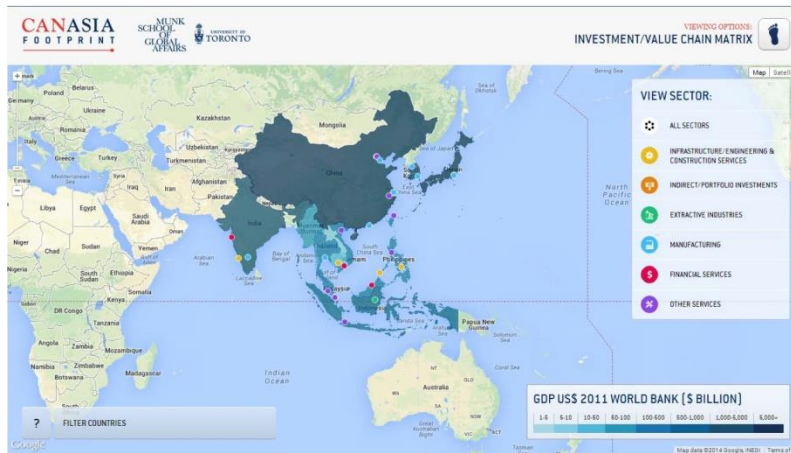
Figure 2 Canada's economic footprint in Asia.

Others are concerned that China's moves into the Indian Ocean are more purely strategic. Partially as a result of those concerns, India has been welcomed into the Pacific and is rapidly developing closer economic and defence ties across the region, in particular with Vietnam, Japan and Australia.